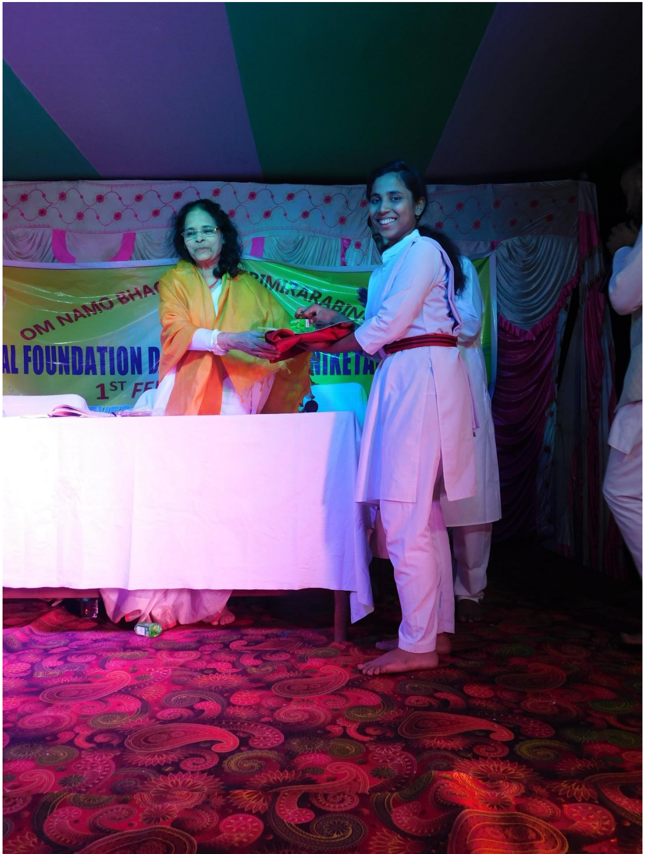
“Only by suffering life grew colourful;” Savitri-228