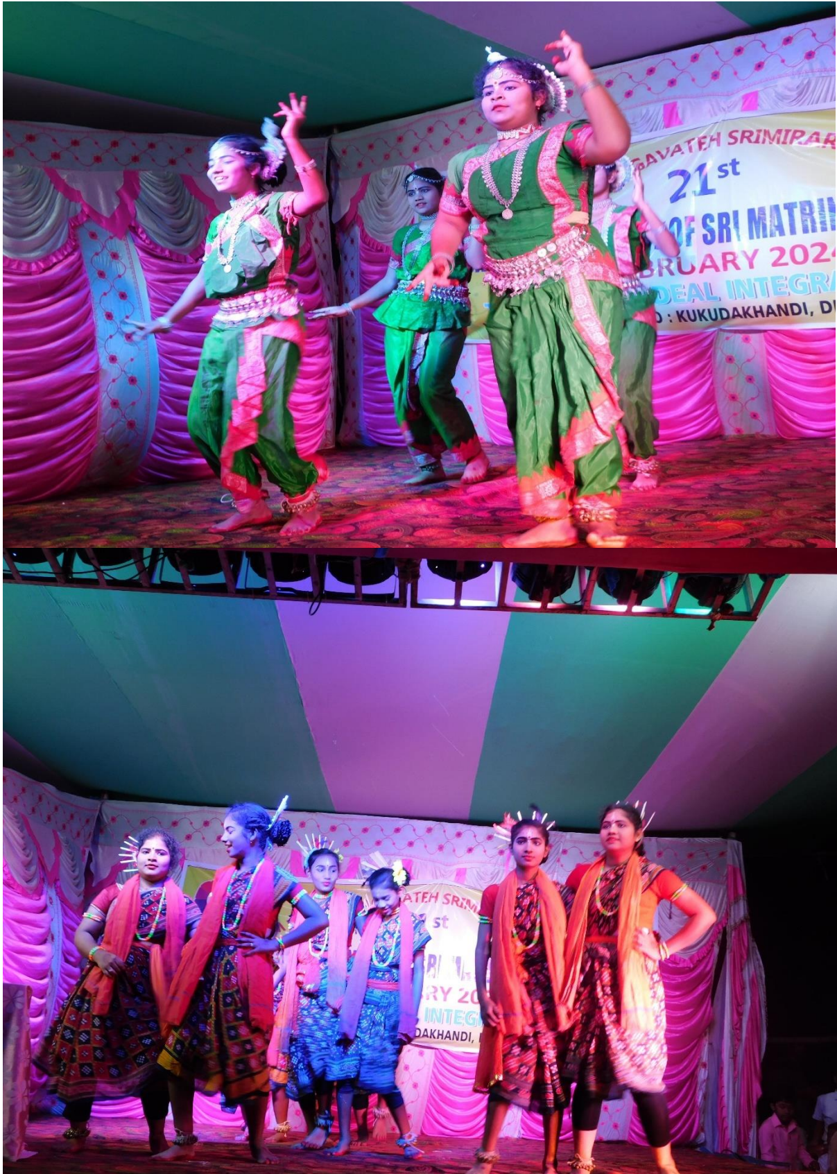
“A scout of victory in a vigil tower, Her aspiration called high destiny down;” Savitri-358