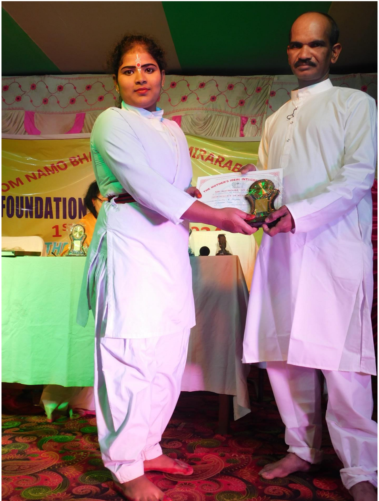
“Attempt, not victory, was the charm of life.” Savitri-249