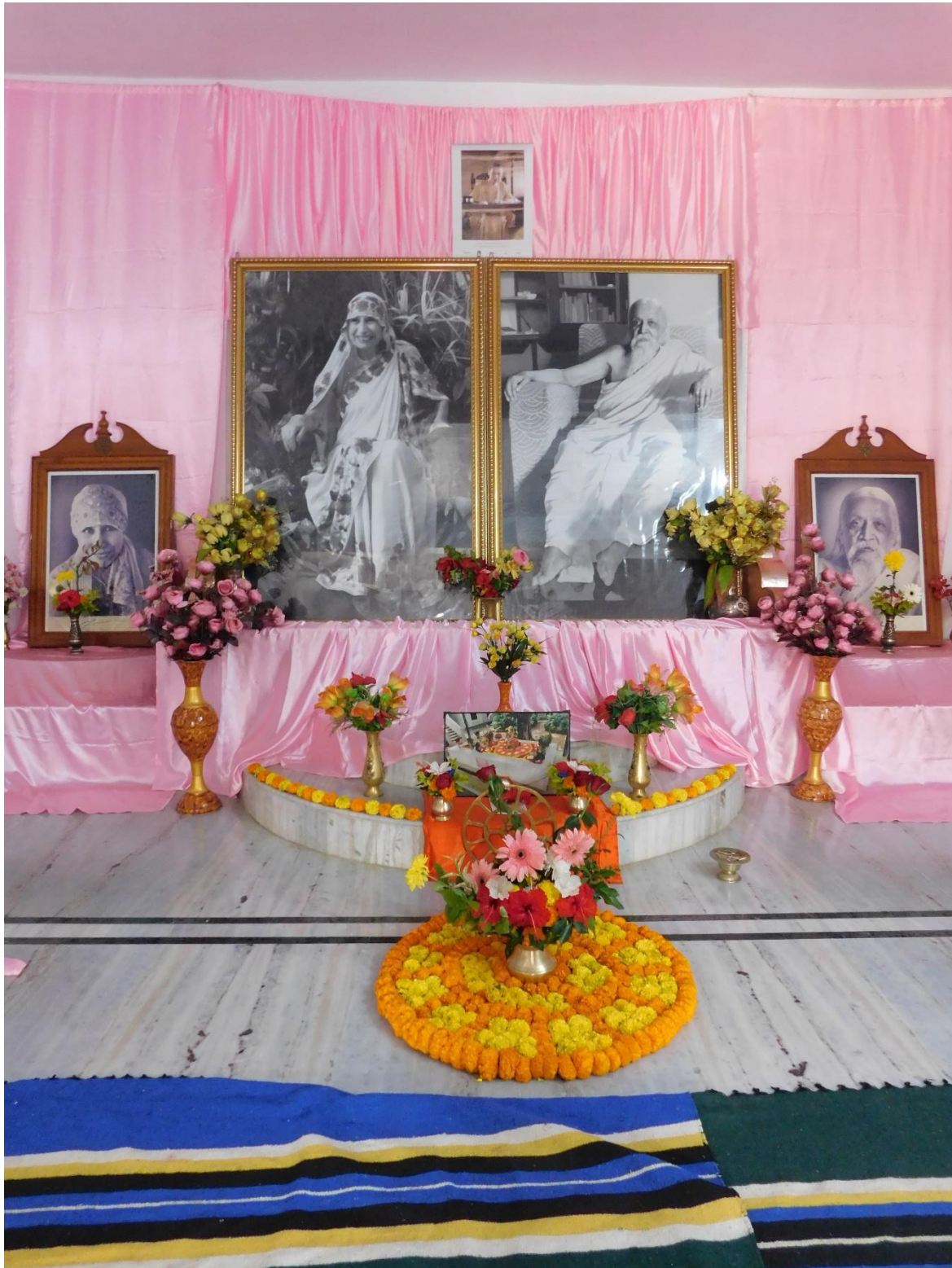
“As those who have lived long made one in love” Savitri-292