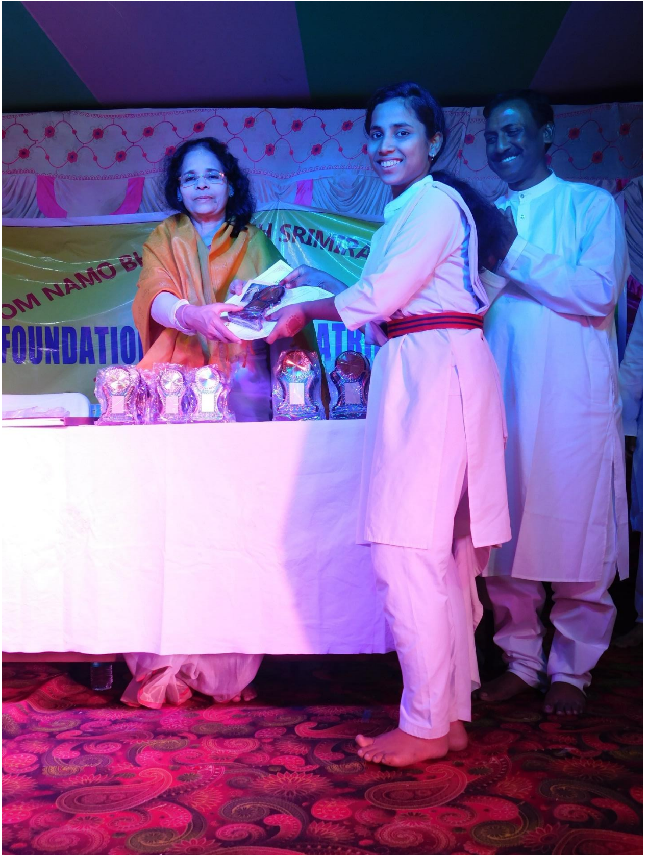
“No victory she admits of Death or Fate.” Savitri-354