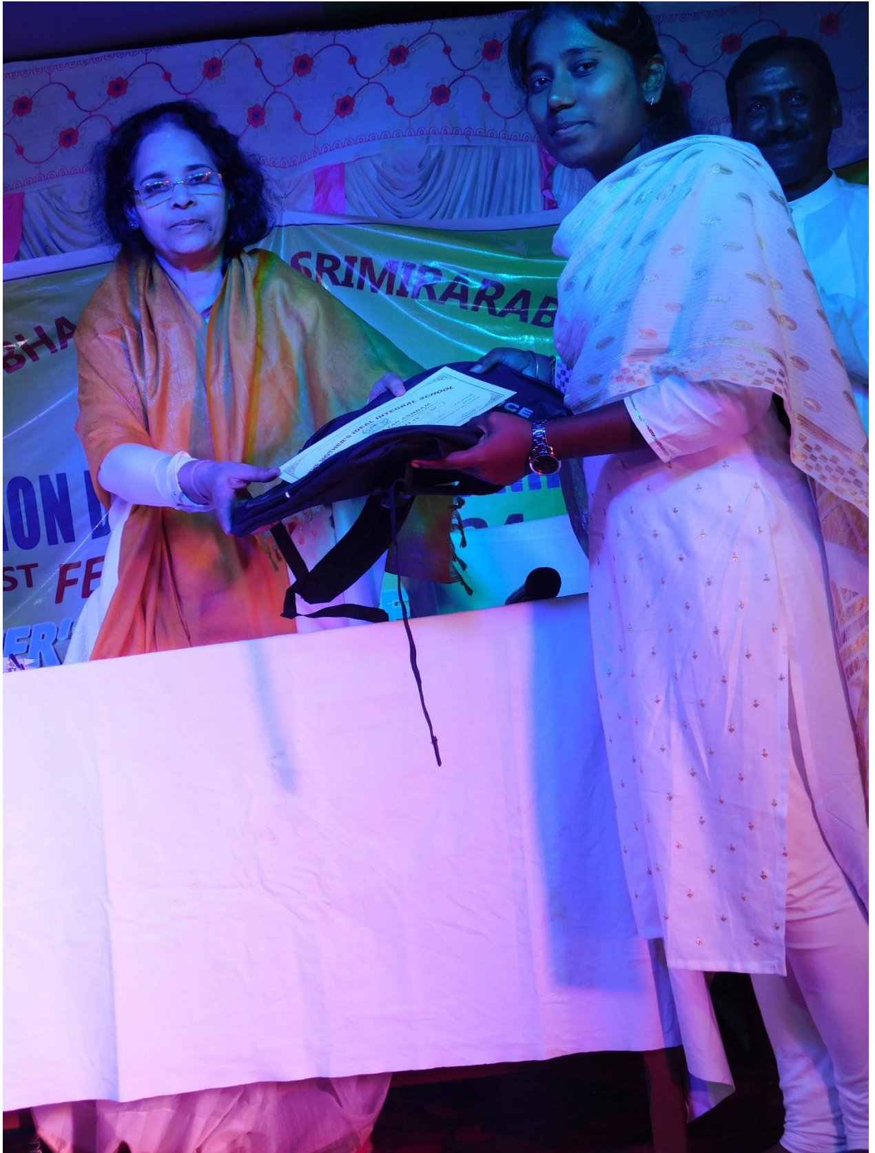
“ଚୈତ୍ୟ ସଭାର ସନ୍ଧାନୀ ଅଭୀପ୍ସୁଙ୍କ ନିମନ୍ତେ ବିଶ୍ରାମ ଏବଂ ପାର୍ଯ୍ୟବ ସୁଖ ନିଷିଦ୍ଧା” ସାବିତ୍ରୀ-୩୩୯