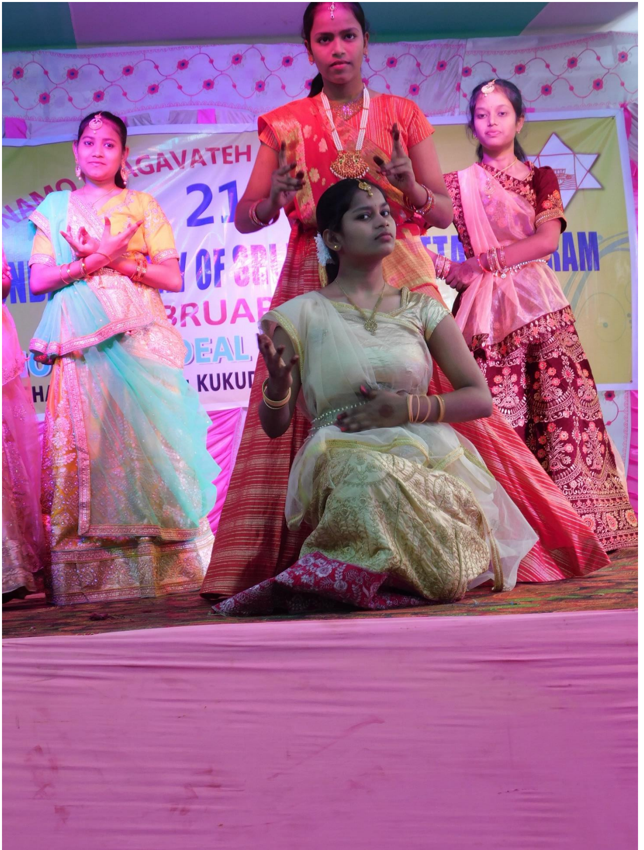
“Earth saw my struggle, heaven my victory;” Savitri-638